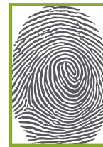
MSO 1300 Series capture